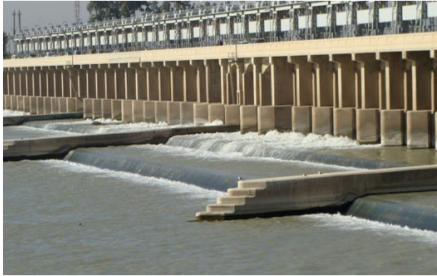
Fig. 1. Kut barrage

After those try we turn on to other side of green energy to get a organize a good project with more benefits to our city by using solar energy from the long daylight and high temperature of the sun, the idea is to be use mirrors for getting concentrating solar thermal power plants.