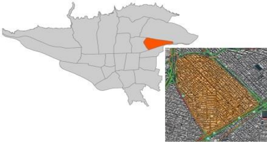
Fig. 2. Location of Lashgar neighborhood.

In order to understand the studied areas, first, the foundations of thought and other studies of researchers were studied and indicators appropriate to the study area were extracted from it and provided to the residents of this neighborhood in the form of a questionnaire.