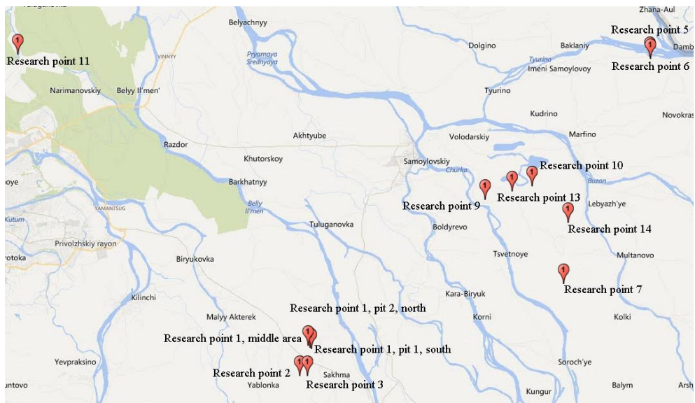
Figure 1. Schematic layout of the river Volga delta stationary areas (base of the map came from https://wego.here.com/ ).

The river Volga delta vegetation cover monitoring investigations have been carried out in the stationary profile since 1978, with the purpose of more representative measure of occurred changes, on the stationary areas runs. Stationary areas were established under the guidance of V.B. Golub in the eastern part of the Volga delta, where hydrological regime anthropogenic changes and vegetation cover franked in a less degree than in the western part (figure 1). According to Astrakhan regional soviet of people's deputies executive committee decision № 616 from 04.10.985 investigation stationary areas (research points) were transferred into the natural sanctuary [4, 5].