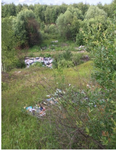
Fig. 2. Landfill at the site of a worked-out quarry open cut.

In the northwestern part of the open cut, there is a water reservoir, which was formed after the groundwater horizon was reached. The area of the water reservoir is 30 m 2 . The water reservoir is a home for beavers (Fig. 3).