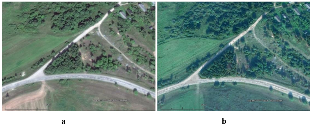
Fig. 1. Space images of the cut in Staritsky District of Tver region: left – 2015, right – 2018.

Sand and gravel-cobble mixture open cut is located near the village Vasilievskoye of Staritsky district. It is illegal, so it is difficult to determine the age. We can suppose that it appeared because of the sand and gravel mixture excavation for road construction in the 1990s. The open cut has an asymmetric elongated shape and irregular relief due to illegal mining. Satellite images of the open cut from 2015 and 2018 are shown in Fig. 1 (a, b). The images were taken with Google Earth Pro.