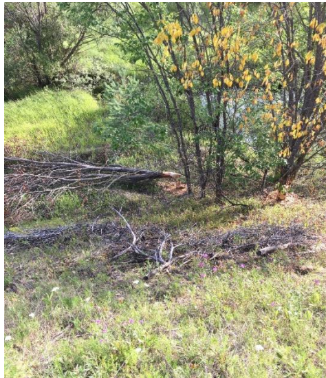
Fig.3. A pond formed at the bottom of a worked-out open cut with traces of beavers' vital activity

In the northwestern part of the open cut, there is a water reservoir, which was formed after the groundwater horizon was reached. The area of the water reservoir is 30 m 2 . The water reservoir is a home for beavers (Fig. 3).