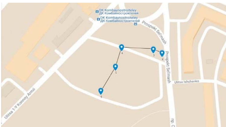
Fig. 1b. Map of the study area (The Ostrovsky Park in Rostov-on-Don) (made by the authors according to the data maps.google.ru)

The sample was represented by dark gray ice with organo-mineral material frozen in it at the station 2. At the stations 3-6, some samples were taken from a freshly fallen and decayed compacted, crystallized snow layer with a grayish hue and inclusions of organic and mineral mass (Fig. 2). The soil under that snow layer was not yet completely frozen, as a result, the transformation of leaf litter continued under the snow cover with the formation of carbon dioxide and related products of biodegradation of buried organic matter. There is a clear border between the newly fallen white loose snow and the stale snow (shown by the arrows) [5]. In total, during the expedition, the participants took samples at 7 stations at the same time.