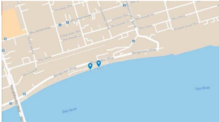
Fig. 1a. Map of the study area (the Embankment area in Rostov-on-Don) (made by the authors according to the data maps.google.ru).