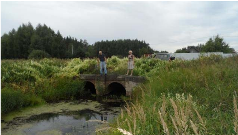
Fig. 3. General view of the section of the main canal and the concrete structure of the dismantled sluice.