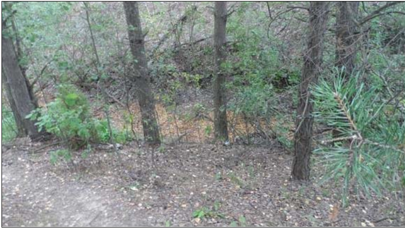
Fig. 1. The bottom of the upland catchwater.

Drainage systems were monitored visually by comparing the current state of open main canals and collectors, upland catchwaters (Fig. 1), hydraulic structures, operational and road networks. The drainage network is now unilateral by the nature of the impact on the water regime of the drained area, that is, it serves only to drain excess water. Irrigation by Fregat machines was introduced at Tinki II facility in the mid-1980s and was used until the end of the 1990s. [5, 6].