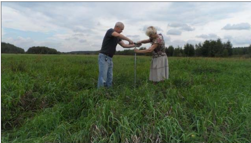
Fig. 2. Soils sampling.

The soil of the objects is peaty of lowland bogs and the level of groundwater is from 100 to 127 cm. Soil samples have been taken with a soil drill by the envelope method in areas of 10x10 m (Fig. 2). The groundwater level was measured with a plover in closed observation wells. The thickness of the peat layer was measured in natural conditions during the excavation of pits.