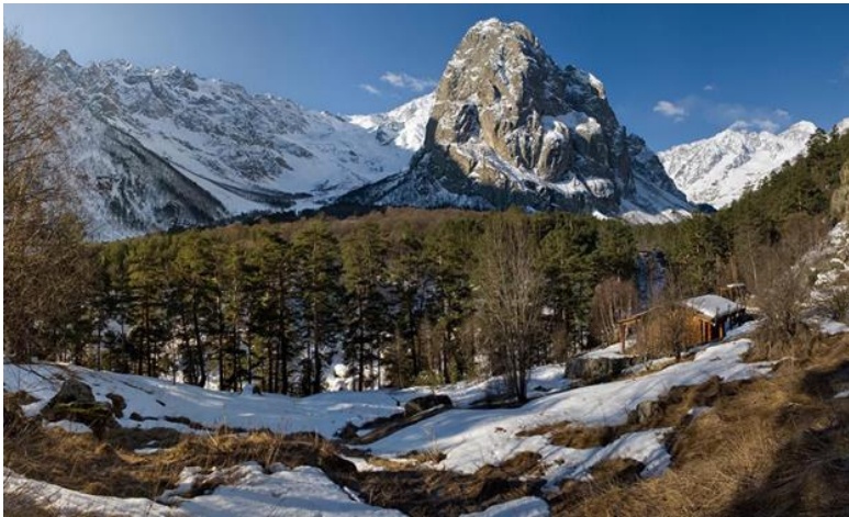
Fig. 1. Tseyskoye gorge

All of these features have an impact on the formation of the faunistic complex of the region.