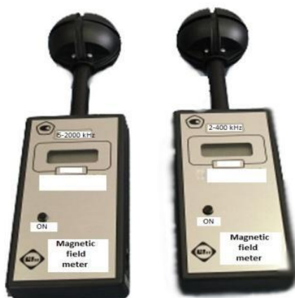
Fig. 1. Magnetic field meter.