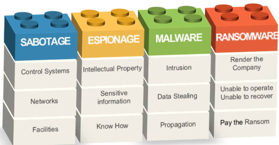
Fig. 3. The concerns of advanced automation that cybersecurity must deal with.