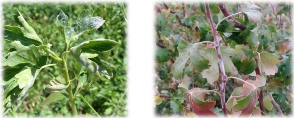
Fig. 1. Infection of leaves and twigs of Cassis with powdery mildew disease.

The primary conidia of the fungus that cause cassis powdery mildew are lanceolate in shape, measuring 38-80 \times 11-19 \mu\text{m} , and averaging 56.1-13.7 \mu\text{m} . Secondary conidia are also cylindrical or slightly enlarged in the third part, measuring 42-63 \times 12-18 \mu\text{m} . Conidia are long, cleistothecia dark brown, large, 150 \times 255 \mu\text{m} in diameter. The structure of the peridia is uncertain. When crushed, it was found that the cells in it were angular and had a diameter of 9-12 \mu\text{m} . It was noted that the tumors of Cleistothecia were once branched, angular-serpentine, and they did not last long, and their size was found to be 60-90 \times 6 \mu\text{m} . It was noted that the Clytothecia had many sacs, which were elliptical in shape and measuring 60-75 \times 27-32 \mu\text{m} . Ascospores were found to be elliptical and measuring 27-33 \times 12-15 \mu\text{m} (Fig. 1).