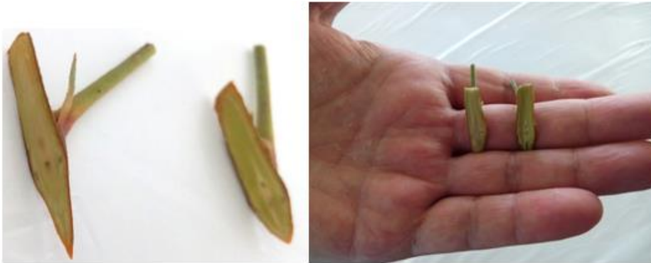
Fig. 1. Interior of the upper-grafted apple buds, where the cut wood layer was left and removed for grafting.

Based on this scientific hypothesis, we conducted a study to study the effect of subcutaneous wood in the grafting of Golden Delicious, Starcrimson, Jonathan, and Renet Simirenko varieties on grafting points M-IX and MM109 for weak growth of apples (see Fig. 1).