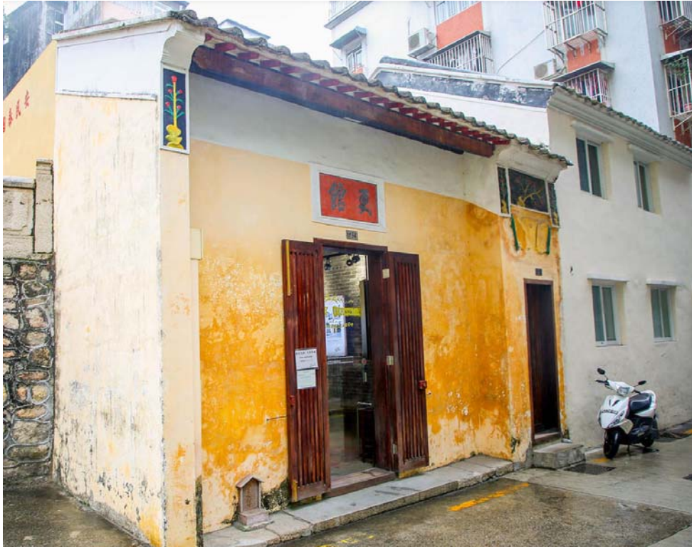
Fig. 1. Exterior of The Patane Night Watch House.

The Patane Night Watch House covers an area of about 63 square meters and is only one storey high. It should be part of a row-style residential building. The architectural form of the traditional Cantonese residential building is basically the same as the bamboo tube house with a surface width of about 6 meters. The depth is between 11 and 12 meters, it is divided into a front seat and a rear seat. It is a single-bay three-entry type. The front seat has a single-sloping tile roof, and the two behind the central patio are double-sloped tile roofs. Both are common styles of Lingnan residential buildings.