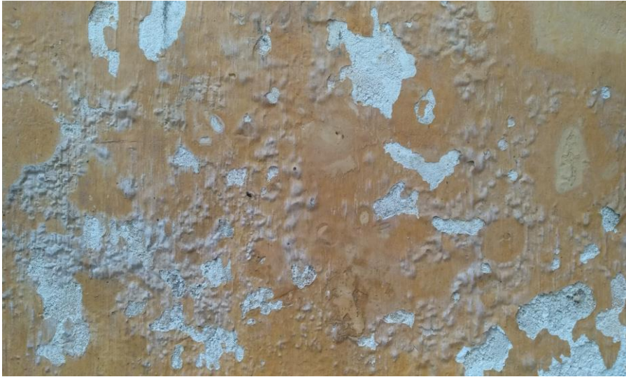
Fig. 2. Facade with blistering and falling off.