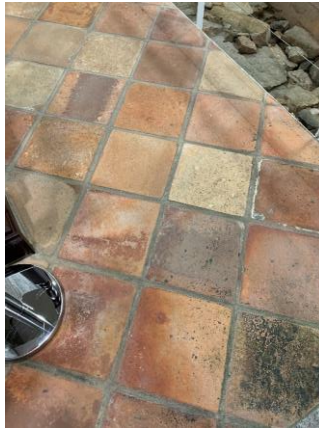
Fig. 4. Ground paving of Chong Sai Pharmacy.

The indoor floor of the Chong Sai Pharmacy is made of orange clay step bricks. The joints of the bricks are about 1 cm. This not only destroys the beauty of the floor, but also causes cracks if the joints are too thick. Especially as the floor tiles, it is easy to cause cracks after the joints are cracked. The tiles are worn or fall off, as shown in Figure 4, the edges of the step tiles on the right side have been worn and turned white. In addition, some floor tiles have been blackened and faded. The brick surface has uneven color, rough texture and lack of daily maintenance. It should be cleaned and maintained in time, otherwise it will easily cause broken windows and reduce the overall environmental quality. The edge of the paving is too hard, the brick body is cut and placed on the edge, and the material is not transitioned. The edge of the brick body after the cut will have uneven gaps, which are easy to seep water, resulting in mildew on the ground and deterioration of the quality of the paving, causing a chain reaction.