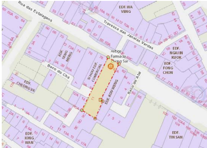
Fig. 1. The floor plan of the Chong Sai Pharmacy (webmap.gis.gov.mo).