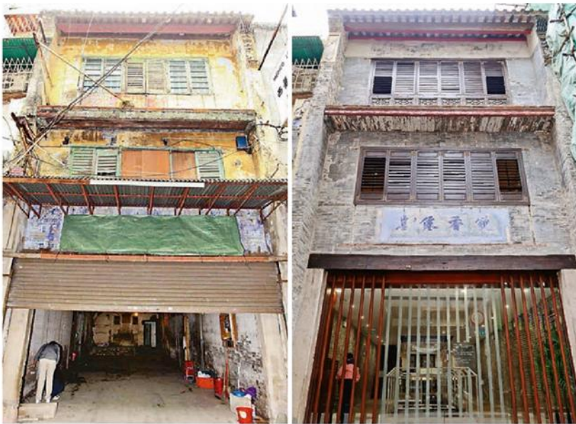
Fig. 3. Comparison of Chong Sai Pharmacy before and after restoration (left old and right new).

Macau is the first stop for Sun Yat-sen to enter society from university, and also the starting point of life and career. He was the first Chinese to use Western medicine to treat patients. The Chong Sai Pharmacy, as an empirical evidence of this experience, has value worth protecting and revitalizing. In 2011, the Macao Special Administrative Region government purchased the building for 36 million patacas and carried out a series of restoration work. Including the restoration of the building's roof, walls and slabs (Figure 3), re-planning the internal space, and installing air-conditioning, elevators, security and fire-fighting equipment for the cultural relics to meet the needs of modern people. In 2012, during the space renovation project, the underground port remains stone structure was excavated, so the internal space layout was further adjusted until the overall building restoration work was completed in December 2016 and it was officially opened to the public.