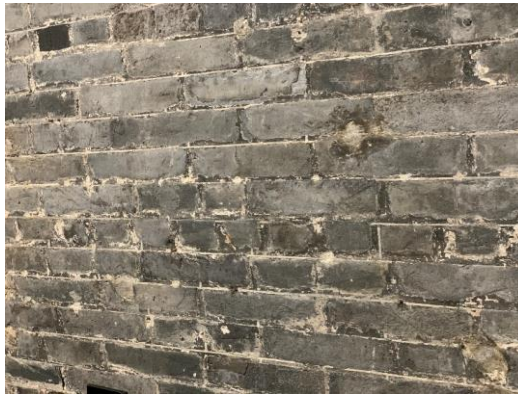
Fig. 7. Detail of brick wall of Chong Sai Pharmacy.

The brick walls of the Chong Sai Pharmacy use cement to fill the gaps and cracks (Figure 7). The physical properties of cement and blue bricks are different. The cement is too hard and impermeable, which will easily cause the brick walls to crack and break again. In addition, the overall color of the brick wall is different from that of the cement. The use of cement to fill the pit affects the beauty of the brick wall, which makes the brick wall less clean and poor in quality. Brick walls have a relatively large proportion of the indoor visual area. Large areas of untidy brick walls will reduce the public's experience of viewing the exhibition and affect the positive effects of cultural communication in the exhibition hall. On the contrary, the public will form negative emotions. In addition, the filling of brick joints overflowing between the blue bricks should be treated in time to keep the brick walls tidy and beautiful to avoid messy caulking.