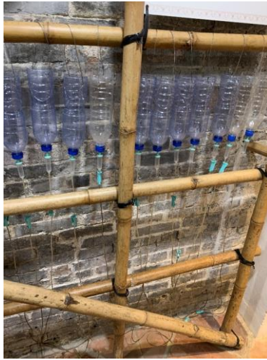
Fig. 8. Desalting by injection.

directly experiment on cultural relics, which will cause the risk of destroying cultural relics. After the cultural relics are destroyed, the original stable physical structure is difficult to restore, and the value and beauty of the cultural relics will be further lost.