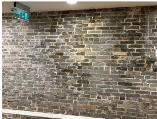
Fig. 6. Brick wall of Chong Sai Pharmacy.

The blue brick wall in the Chong Sai Pharmacy was damaged due to weathering (Figure 6). After the damage, dark yellow salty bricks were used to fill. Not only the appearance is damaged, but the salty bricks are acidic. The hardness and life of the bricks will be greatly reduced, which is easy to cause a breakage of a brick wall. The combination of salty bricks and weakly alkaline blue bricks will affect the surrounding blue bricks, acidify the surrounding bricks, and reduce the overall quality of the wall. From the perspective of cultural customs, salty bricks are often used in places such as cooking fume kitchens, toilets, huts, pig pens and cattle pens, and are not suitable for use in residential interiors, which violates the residents' habits. In addition, the early blue bricks were mostly made by hand-moulding, and there would be a difference between concave and convex surfaces. They should be arranged according to the convex surface on the top and the concave surface on the bottom. It was found on the site that some blue bricks were backfilled without paying attention to the unevenness of the blue bricks. Reverse backfilling not only decreased the aesthetics, but also made the stability of the brick wall down. Seriously, it would also cause the brick wall to collapse.