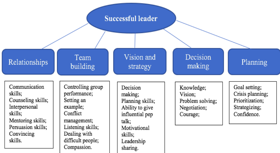
Fig. 1. Leadership skills composition.

On the other hand, Chobharkar stated that each of the 5 skills is closely linked with other skills. In fact, the successful use of a skill in a specific situation requires the use of several other skills that are related to the 5 basic leadership skills and those related to each of them can be grouped in Figure 1 that shows the interference between the leadership skills.