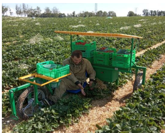
Fig. 2. The process of harvesting strawberries on an electric drive platform.

On the graph (Fig.3) shows the change in productivity when using an electric platform and without it, depending on the yield at the time of harvest. The analysis of this graph shows that the use of the platform at the very beginning of the season with a yield of up to 20 c / ha does not increase productivity compared to manual harvesting without the use of the platform. The predominance in productivity using the platform can be observed with a yield at the time of harvest of 30 c / ha or more. Thus, with a yield of 50 c / ha, the