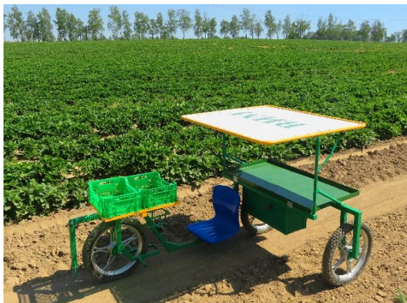
Fig. 1. Electric drive platform (side view).