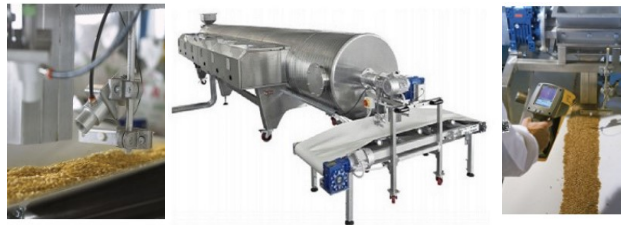
Fig. 6. The system MISYA AH-36-T [16]

The device has a maximum production capacity of 800 kg / hour with a power of 36 kW. All process parameters (temperature, power, speed) are constantly monitored using a PLC-based electronic control and management system.