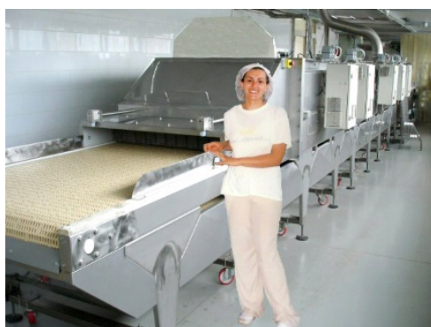
Fig. 2. System used for drying sweets and vegetable products [15]

In this regard, figure 2 presents a system used for drying sweets and vegetable products.