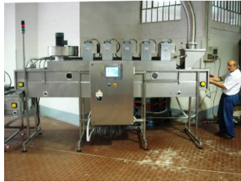
Fig. 3. The system for pasteurizing packed and unpacked products [15]

The company also produces detachable microwave chambers, made to facilitate transport and treatment at the place of using. Their power varies from 3 to 12 kW. Figure 4 presents the mobile treatment system.