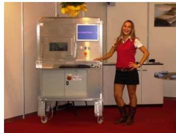
Fig. 5. Laboratory research system [15]

For laboratory research use, special microwave ovens are sold, having the temperature controlled by an infrared thermometer. The power varies from 1 to 6 kW. Figure 5 presents the laboratory research system.