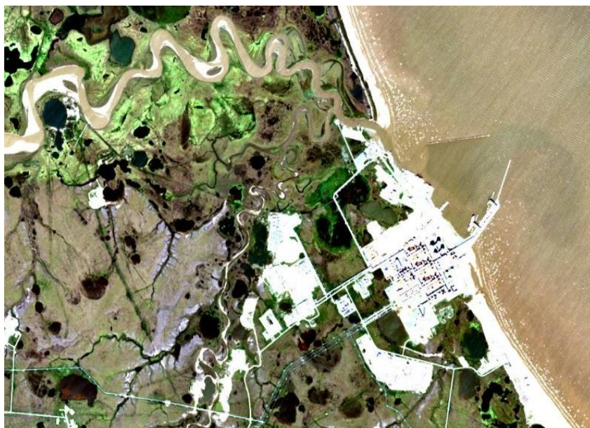
Fig. 1. Territory around liquid natural gas plant (LNGP) at Sabetta, visualized for ES within ASTSD purposes with GIDOP EOS LV Normal Color Application, 21/08/2020, scale 1 km.

In fig.1-3, we show the examples of above mentioned GIDOPs usage.