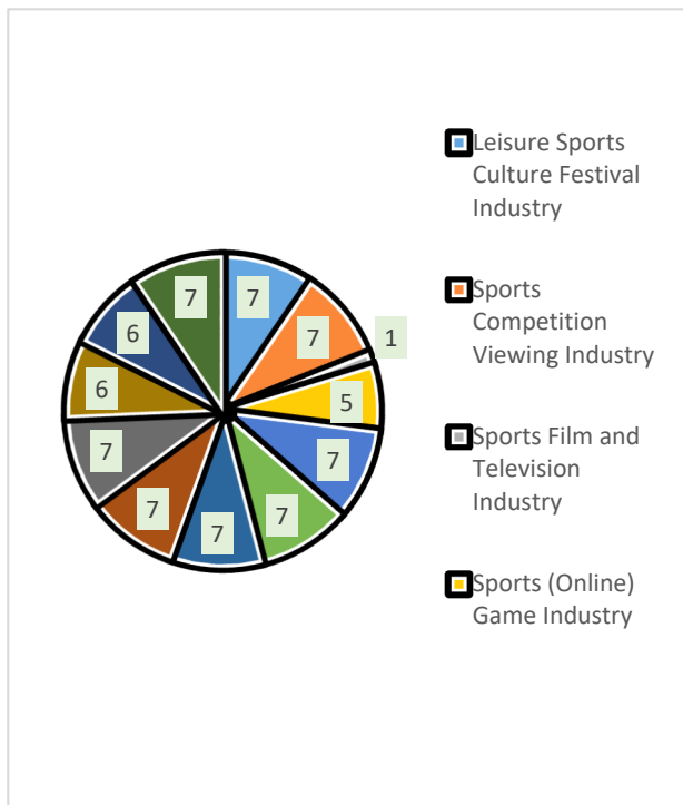
Figure1. Distribution of Sports Culture Industry

According to the results of the questionnaire survey, it can be seen that the sports competition viewing industry, sports leisure cultural industry, sports folk cultural activities industry, leisure sports tourism, sports leisure cultural exhibition industry and other industries have a good development trend. The percentages are 100%, 85.7%, 71.4%, 100% and 100% respectively.