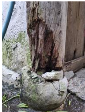
Figure 2-1-2 Damage to wood column