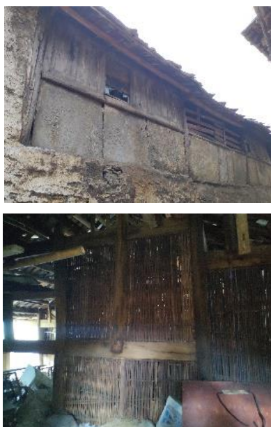
Figure 2-2-2 Types of non-load bearing walls

Non-load-bearing walls of traditional buildings in this cottage include wood-paneled walls, combined walls composed of stone and wood panels, and bamboo-woven walls and bamboo-clad mud walls (Figure 2-2-2), which are important components of the enclosure structure between the two columns of traditional buildings. Plank walls and combination walls are common wall types in traditional buildings in this stronghold and are also widely used in traditional buildings in Guizhou region.