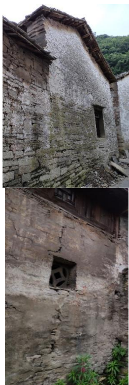
Figure2-2-1 Breakage of wall