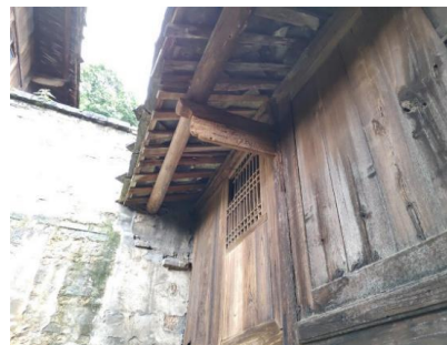
Figure2-1-3 The stigma purlin bearing method of traditional buildings in Benzhai