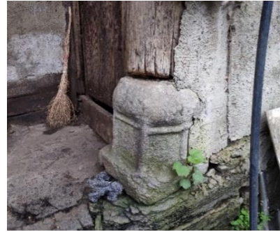
Figure 2-1-1 Column foundation appears

Second, the local occurrence of column base dislocation, column directly resting on the column base, because of uneven settlement and other reasons to produce column base dislocation, coupled with the humid climate and precipitation weather led to water penetration between the column base, accelerating the column tilt, stone softening, reducing its weighing compressive resistance