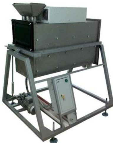
Fig. 2. Microwave UMOS-02 for processing and drying of bulk products

A detailed description of the principle of operation of the Microwave UMOS-02 and its technical information are given in [9].