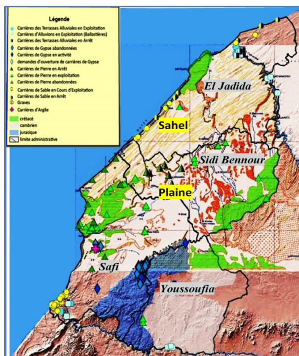
Fig. 1. The territorial distribution of inventoried quarries in the Doukkala-Abda provinces considers the region's geological and geomorphological structure.

In this perspective, the present study, devoted to the coastal quarries of the Doukkala-Abda coastal line, falls (Fig. 1). It is a question of arriving at a reasoned and controlled management of these quarries while maintaining a balance between socio-economic development and preserving the environment, namely protecting landscapes, sites, and sensitive natural environments.