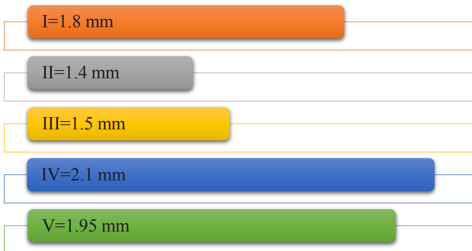
Fig. 3. Thickness of two-layer knitted fabric

When the V variant of a two-layer knitted fabric causes a decrease in the bulk density of the knitted fabric is achieved by changing the methods of joining the layers of the two-layer knitted fabric.