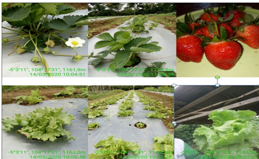
Fig. 2. New potential crops: Strawberry and Head Lettuce introduced in Sekincau

Since the purpose of the plot demonstration approach was to induce farmers to plant these crops with commercial purposes, yield has not been evaluated yet.