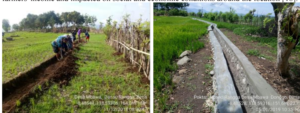
Fig. 1. Channel condition before (A) and after (B) rebuilt

Disruption or damage to one part of irrigation building will affect the performance of water delivering system, resulting decreased in efficiency and effectiveness of irrigation. If this condition is allowed to continue and is not immediately addressed, it will have an impact on the expected decline in agricultural production, and have negative implications for farmers' income and impacted on social and economic conditions around the location [18].