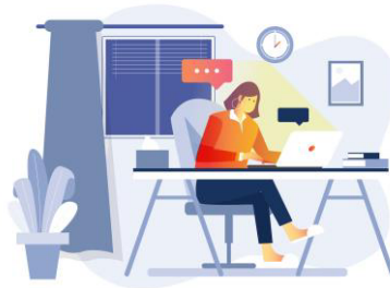
Fig. 7. The illustration of WFH preferences [29].