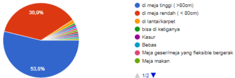
Fig. 5. Preferences of gadget position.

The last point of people preference in making their work/study place during a pandemic is gadget positions. We all know that gadgets like laptops, smartphones, tablets and other electronic devices are mandatory things in online activities. Most respondents choose to put their gadgets on the desk/table (figure 5). They avoided working on the floor or other furniture. This preference might relate to ergonomics and their need to see the monitor on the same level of the head. That situation could be reached only if they put the gadgets above the table.