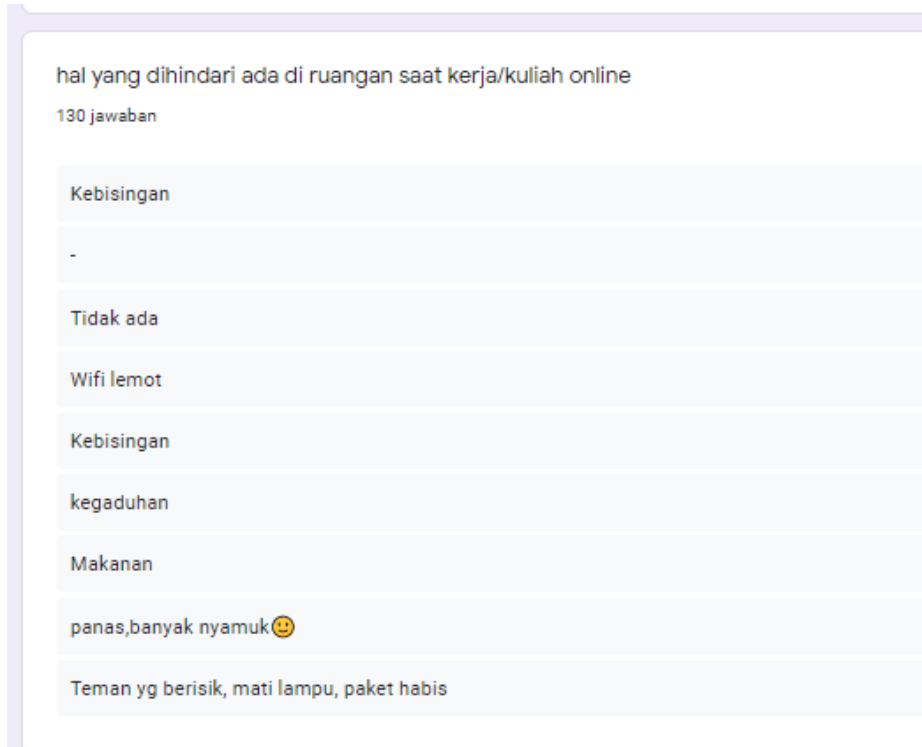
Fig. 6. The disturbance.

After the preferences were shown before, some disturbances were collected in figure 6. The main problems for doing Work/Learn from Home is noise or audio disturbance. There is a correlation between the vocal intensity of the teachers and the noise in the classroom. The vocal intensity measures also relate to the symptoms of vocal tract discomfort before and after classes [28]. People need to be concentrated or focused during their tasks. Some noise may distract them and make the place not comfortable anymore. Therefore, the place must be far from audio disturbances. There are also other problems, such as internet connections, food, and electricity problems that make problems on their work/study from home.