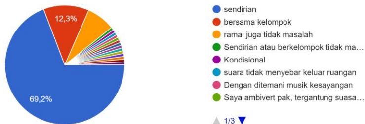
Fig. 3. Preferences on companion during WFH.