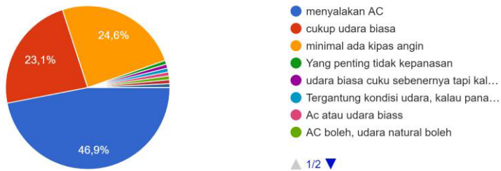
Fig. 4. Preferences of air condition of work/study place.

In the more deep study, people like to turn on their Air Conditioner (AC) during activities at home, as shown in figure 4. They prefer to make their place more breeze and cool with AC or ceiling/desk fan. Cool scent has brought many motivations in working or learning rather than natural ventilation. With a cool atmosphere, people were attracted and more comfort in doing their duties and gained more experience [27].