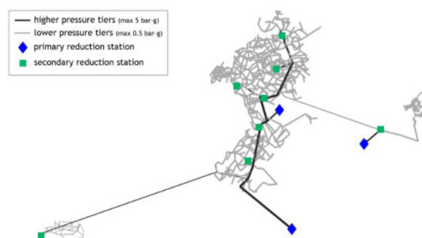
Fig. 1. Distorted representation of the topology of the distribution gas network infrastructure.

consists of two highly meshed infrastructures: the main one serving the main urban area and a much smaller one that serves a satellite urban conglomerate. The lower pressure network of the urban area is fed by six pressure regulators which are connected to the main higher pressure backbone plus one pressure regulator delivering the gas from the higher pressure duct connected to the third city booth. The lower pressure network of the satellite urban conglomerate is fed by a single pressure regulation station connected to the main higher pressure backbone by means of a branch pipe. The total number of pressure regulators in the distribution network is eight. In Figure 1 a distorted version of the network structure is given.