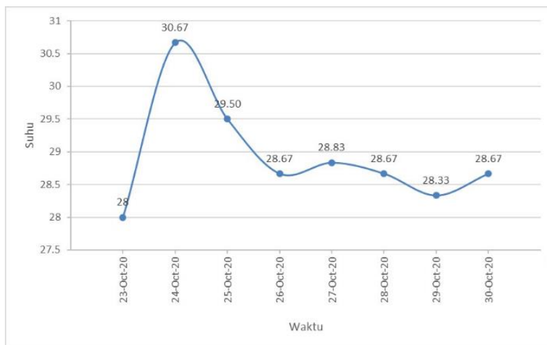
Fig. 1. Graph of temperature development compost

Figure 1 shows the development of the compost temperature during the process. On the first day of composting (October 22, 2020) the temperature was 28°C, on the second day the temperature rose to 30.67°C, then on the third day to day 8 (October 8, 2020) the temperature gradually dropped slowly.