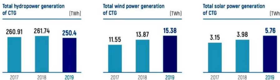
Fig. 2. Total energy generation of the CTG in different categories (TWh).

In the past few decades, the environmental governance industry has continued to grow. From the traditional point source pollution control to urban/rural sewage/garbage plants, and then to the regional remediation of water environment in recent years. Although from the perspective of the project content, the water environment project in a single area contains multiple elements such as sewage treatment plants, river channels etc., which is quite comprehensive already, it is still fragmented governance regarding the level of the whole Protection. As it's shown from a series of environmental management projects carried out by CTG in the early stage, water environment governance under the condition of regional division is still the main focus, and the regional linkage and the comprehensive governance/management mechanism of large river basins have not been fully formed.