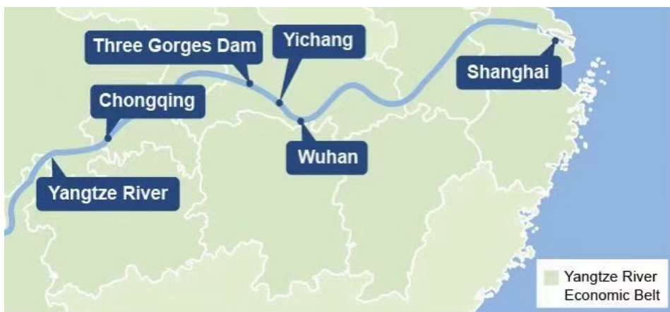
Fig. 1. Map of the Yangtze River Economic Belt.

The history of water resource utilization in the Yangtze River Basin is also since ancient times, from irrigation and boating to flood control and hydropower development. Due to the excessive development of the Yangtze River, the current situation in the entire basin in terms of water quality, water quantity, as well as biodiversity has become very severe. Some river sections, especially those in the major cities along the river, have serious water pollution and prominent lake eutrophication problems. Meanwhile, the heavy pollution and energy-consuming industries have brought greater environmental risks to the water environment of the watershed. Facing the interweaving of new and old problems, water resources protection under the new situation has a long way to go.