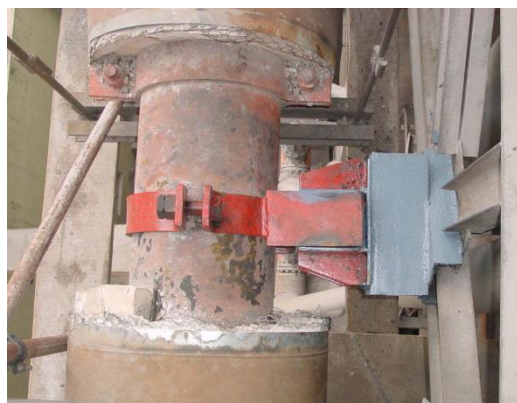
Fig.2. Site installation drawing of No. 10 support and hanger limit.

The effect pictures of the pipe section of No.10 support hanger and No.22 support hanger in the Z direction (pipeline axial direction) after installation are shown in Figure 2 and Figure 3. The effect pictures of the pipe section of No.7 support hanger and the axial damper section of No.19 support hanger are shown in Figure 4 and Figure 5.