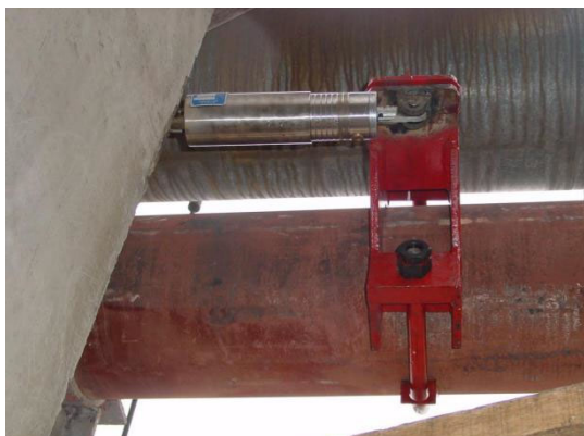
Fig. 5. Installation drawing of pipe damper of No. 19 support and hanger.

(2) The stress analysis results of the pipeline in the hot section of reheat steam show that the primary and secondary stresses of the pipeline system meet the standard requirements, and the installation of limit device and hydraulic damper has no impact on the stress of the pipeline system.