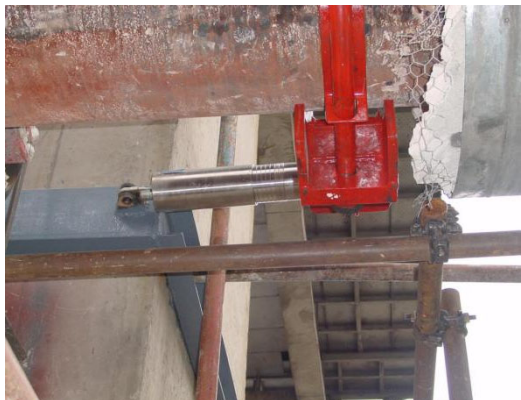
Fig. 4. Installation drawing of pipe damper of No. 7 support and hanger.