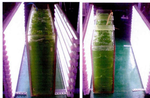
Figure 2 Flat-plate photobioreactor