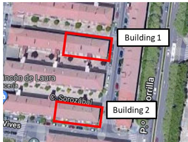
Figure 3: Location of the buildings used as demo-sites The characteristics of the two buildings can be seen in Table 1.

The tool has been demonstrated in one district: Cuatro de Marzo district in Valladolid (Spain). This district counts on many buildings that share the same typology. In this case, the demonstration has been launched for 2 residential buildings (individual blocks) that can be seen in the Figure 3.