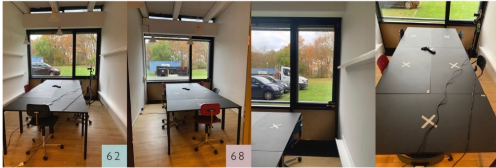
Figure 2: Setup in room. The "X" marks the placement of the subjects laptop 30 cm from the edge of the table.