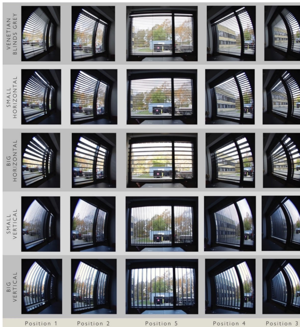
Figure 3: An overview of the different solar shading conditions seen from each subject position in one of the rooms.