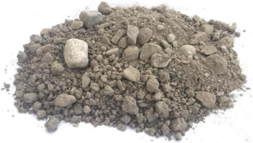
Fig. 2. Disturbed sample of macrofragmental soil.