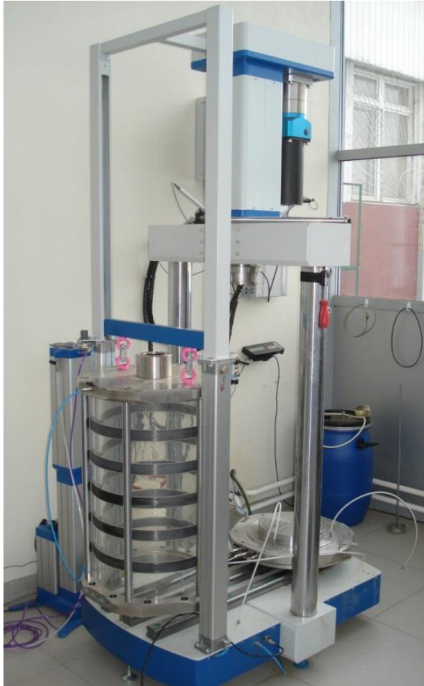
Fig. 1. The triaxial compression test facility (for samples with a height of 600 mm and a diameter of 300 mm).

The macrofragmental soil was tested using disturbed samples with \rho=2.1 \text{ g/cm}^3 and water content W=10\% . Sample preparation involved removal of all particles larger than 50 mm. Figure 2 shows a sample of macrofragmental soil with disturbed structure.