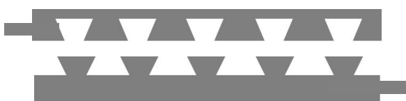
Fig.3 Structure diagram of dovetail type drain plate