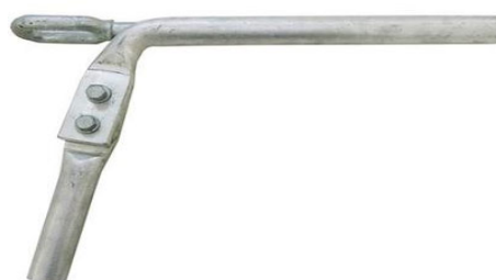
Fig.1 Common types of the equipment clamp