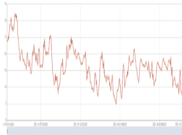
Fig. 4 Main bearing rear end cap inclination data sampling