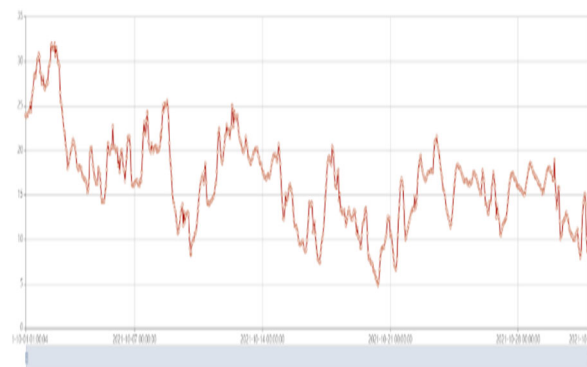
Fig. 5 Temperature data sampling of rear end cover of main bearing