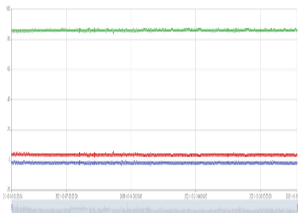
Fig. 3 Main bearing rear end cap displacement data sampling