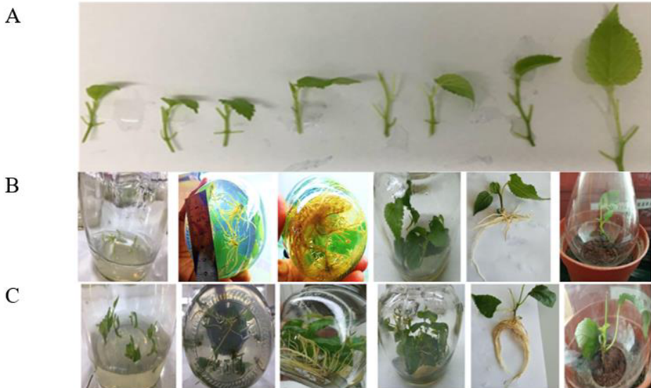
Fig. 2. Development of selected research facilities in the WPM feed environment under “in vitro” conditions and adaptation to the substrate. A-view of the grown explants without preliminary root dressing in the WPM nutrient environment of the Jarariq-9 variety (B) and Uzbekistan hybrid (C) explants and adaptation to the natural substrate.

It was observed that the indicators of budding of the explants differed from each other and were 73.13% in Uzbekistan hybrid and 76.4% in Jarariq-9. The highest indicator was obtained in WPM in our nutrient medium selected for in vitro propagation of Uzbekistan hybrid and Jarariq-9 variety (Figure 2). In the course of research, it was noted that hybrid cultures are easier to propagate in vitro than mulberry cultivars. In our further studies, only the most effective nutrient medium in the propagation of mulberry cultivars was carried out in WPM. In Table 2, young saplings grown from Uzbekistan hybrid seeds on the 14th day of observation were 4.16 cm tall, 0.23 cm root length, 2 roots, and according to the average results obtained on the 24th day of observation, the height was 9.16 cm.