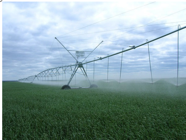
Fig. 2. Sprinkler machine Kuban-LK1M "Cascade".

The developed technology was implemented on sprinkler machines "Kuban-LK1M" and "CASCADE" installed on irrigated fields in LLC "Nashe Delo" (Krasny Yar village, Engels district, Saratov region) and in NPO "Volga region" (Stepnoye village, Engels district, Saratov region), Figure 2.