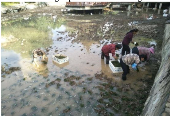
(a) Cutting method-artificial cutting

The sediment types of Donghu Lake can be roughly divided into riprap-gravel hard sediment, natural silt sediment and the combination of them. The roots of submerged plants in riprap gravel base can not be planted, so it is necessary to use degradable non-woven fabric to wrap and throw seeds. The natural basement has a lot of subsoil and soft soil, which is suitable for cutting. Therefore, the restoration of submerged plants in Donghu Lake mainly adopts seed throwing method and cutting method, and the submerged bed planting method is adopted in the local deep water area. According to the underwater topography and sediment characteristics of different sub-lake areas, seed throwing method and submerged bed planting method are adopted in areas with deep water depth; Seed throwing method and cutting method can be used in other areas. Three construction methods of submerged plant are shown in Figure 2.