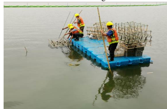
(d) Immersed bed planting method