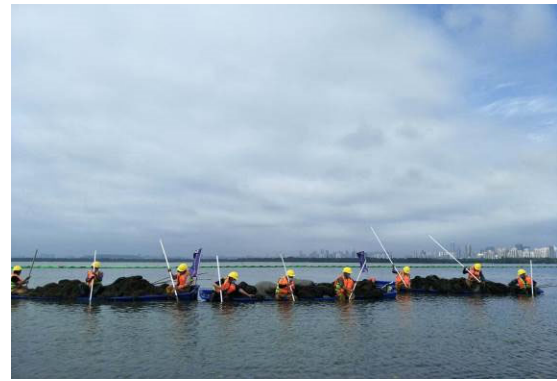
(b) Cutting method-auxiliary tool cutting