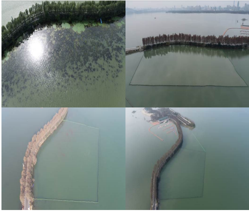
Fig. 3 Aerial photo of submerged macrophyte planting area of Donghu Lake in Wuhan