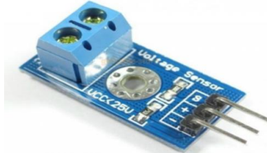
Fig. 6. Voltage sensor

outputs in the form of analogue voltage signals, switches, aural signals, analogue current levels, frequencies, or even outputs that are frequency modulated. To put it another way, certain voltage sensors can produce sine waves or pulse trains, but others can provide outputs that are modulated in terms of amplitude, pulse width, or frequency. Voltage dividers serve as the foundation for the measurement in voltage sensors. The two most common types of voltage sensors are resistive type voltage sensors and capacitive type voltage sensors in Fig.6.