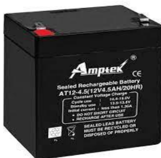
Fig. 5. Battery

Lead acid battery chargers typically do two things. Restocking capacity comes first, usually as soon as it is practical. The second is capacity preservation by compensating for self discharge. For the optimal performance in both cases, lead sulphate is converted into lead on the battery's negative plate and lead dioxide on the positive plate. Once the majority of the lead sulphate has been converted, over-charge reactions start, and they typically produce hydrogen and oxygen gas. The electrons that go from a terminal marked "negative" to a terminal marked "positive" are generated by an external electric circuit. Redox processes transform high energy reactants into lower energy products when a battery is coupled to an external electric load and the free energy difference is supplied into the external circuit as electrical energy. A "battery" used to be a device made up of several cells, however currently, devices made up of a single cell also come into this category in Fig.5.