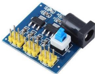
Fig. 4. Atmega328p Microcontroller

supply units, and uninterruptible power supplies are just a few examples of the many different types of power supplies available, each with its own specific features and benefits (UPS) in Fig.4.