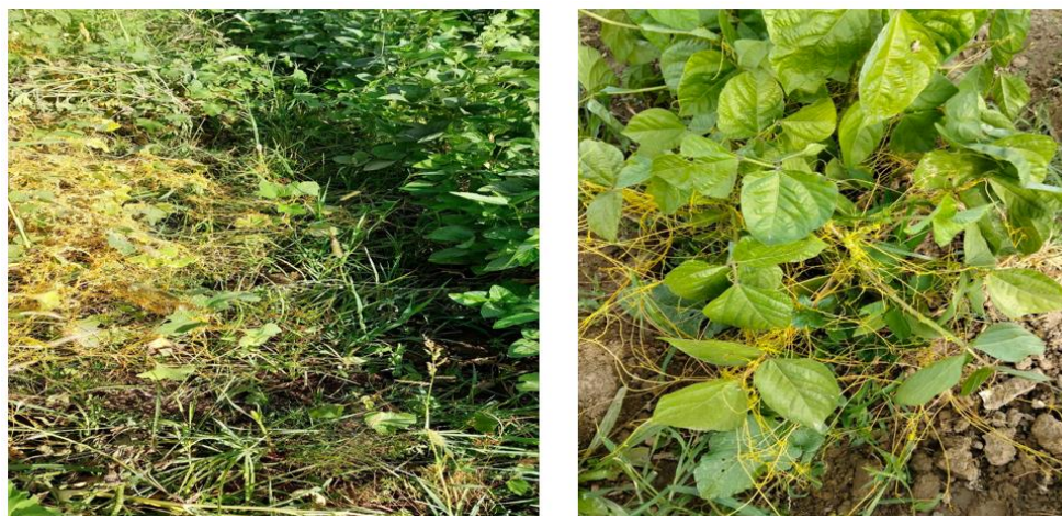
Figure 1. Fields affected by the projectile and surrounding areas.

In the conducted experiments, the study of the effect of the use of Pilot herbicide at different rates against the soya sown field was continued in 2022 at the experimental station of the Tashkent State Agrarian University in 5 variants and 4 repetitions. Each option plot was taken as 84 m 2 . Along with sowing of soybeans in the fields, sorghum seeds (200 pieces) were sown on the surface of the soil to a depth of 3-4 cm (Figure 1), then Stomp 33% ek of 1.5 l/ha as a standard and Pilot herbicide 0.5.