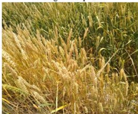
Plants infected with fusarium during milk ripening