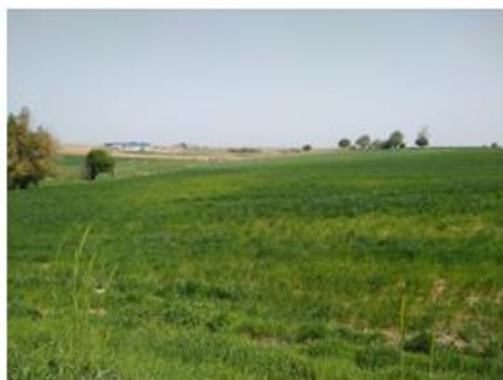
Manifestation of wheat fusariosis in field conditions