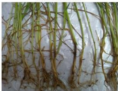
Plants infected with fusarium during the vegetation period