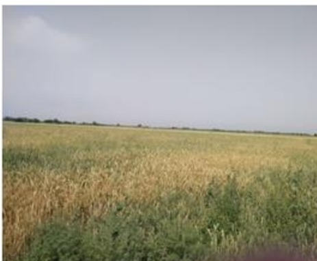
Plants infected with fusarium during milk ripening