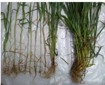
Healthy and fusarium infected plants