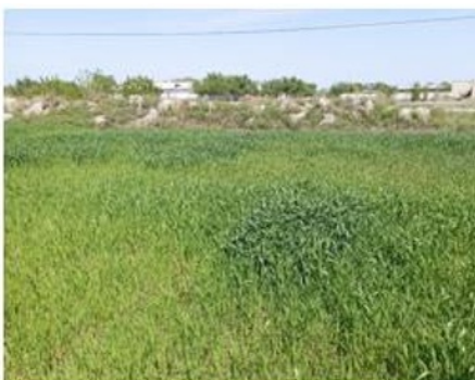
Focal formation of fusarium disease in field conditions