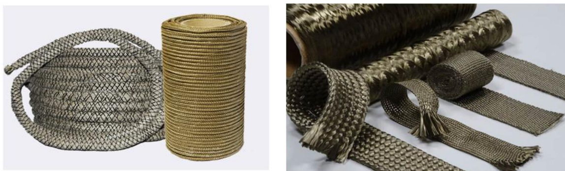
Fig. 2. Cord and ribbons from super fine basalt thread

Cords and ribbons made of super thin, pure basalt thread on cord weaving machines (Fig. 2) are widely used as thermal insulation elements in heat distribution systems, heat aggregates, melting and heat treatment furnaces and drying cabinets of various sectors of the national economy of a number of foreign countries [10].