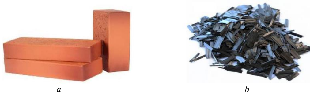
Fig. 1. External view of "Basalt FTM" brick (a) and basalt fiber (b)

In-depth study of the physical-mechanical and physical-chemical properties of basalt rocks expands the possibilities of their targeted use. For example, R.K.Rashidova, in her research under the leadership of A.A.Kurbanov, theoretically substantiated the possibility of obtaining a new heat-resistant product based on the raw materials of the "Aydarkol" basalt mine of our Republic. Among them are "Basalt FTM" bricks, which are used for the inner side of metal melting furnaces in the metallurgical industry based on the new composition (Fig. 1, a).