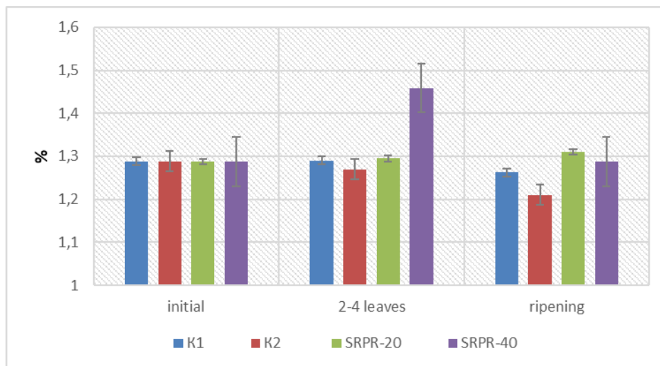
Fig. 1. Effect of SRPF on humus content in soil

In the experiment, the level of ammonium forms of nitrogen as a whole varied within a narrow range - 1.46-3.61 mg N-NH 3 , and only in the control variant in the budding phase the highest amount of ammonium ions was found - 5.89 mg N-NH 3 in 100 g soil. It is important that in all phases of development in the soil fertilized with SRPF-20 and SRPF-40, the level of ammonium ions was lower than K1 (by 6-75%) (Figure 2 A).