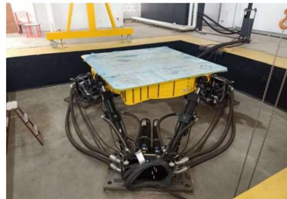
Fig. 1 Multi-Axial Shaking Table (MAST)

The dynamic response of a typical Indonesian masonry structure is set to be tested on an earthquake shaking-table, as depicted in Figure 1. This shaking table is a Multi-Axial Shaking Table (MAST), capable of simulating dynamic motion in a six-degree-of-freedom (6-DOF) system with a relatively high frequency (50 Hz) and a broad acceleration amplitude range (6 g). It can handle specimens up to 2 tons (maximum payload).