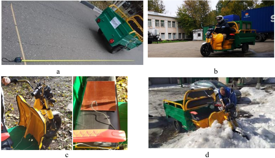
Fig. 4. ECT dynamic tests: a - speed and braking performance; b - mileage; c - vibration and noise; d - climatic tests

Figures 4, a - 4, d show fragments of dynamic tests related, respectively, to the determination of the maximum speed and braking distance (this type of tests was combined into one test) [13], the mileage on a single battery charge, the study of hygienic characteristics (vibration and noise), as well as seasonal climatic tests.