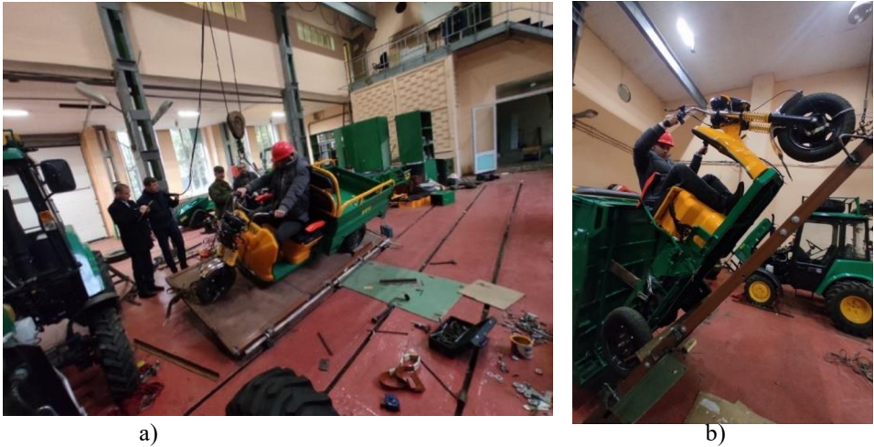
Fig. 2. Stability tests: a - transverse stability with the body lowered; b - longitudinal stability with the body raised

The stability tests according to list item 7 are especially noteworthy, for which a specialized bench was designed in the form of a platform tilting in two planes with the elements of the machine fixation on it (Fig. 2). The position of the machine and the sliding and tipping angles were measured using a three-axis accelerometer.