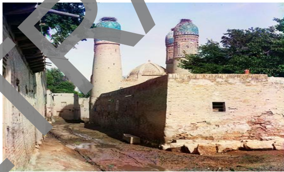
Fig. 2. Sewage shown in the Chorminor street in the Bukhara city, waste water. Photographed in 1913.

The lack of fresh water in the ditches and ponds in Bukhara was also demonstrated in the shrinkage of cultivated land and gardens. There were a number of efforts to improve the ecological situation by landscaping and greening the city of Bukhara, one of which was a plan to divert water from Amudarya to Bukhara by mining a large trunk canal. The idea originally came from the pen of Ahmad Danish, the last encyclopedist scholar of Bukhara, who addressed Emir Muzaffarkhan in this regard. This appeal of Ahmad Donish was gone in vain, and it can be concluded that the media outlets of the Bukhara was the next promoter of this idea. Ghiyas Alidin, an active correspondent of the newspaper “Turan”, who later became an editor of Modern Sciences in Istanbul, was one of the active supporters of the use of Amudarya waters in the improvement of the ecological situation in Bukhara. He published