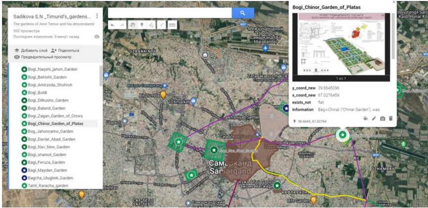
Fig.1. Interactive storytelling map "Samarkand Gardens of the Timurids of 14-15th centuries" with brief information about each of the 17 gardens in pop-up windows. Author Sadikova S.N.

The author classified all the gardens of the Temurids according to their functional characteristics. Table 1. shows this classification with a brief description about the features of each garden and the year of its creation.