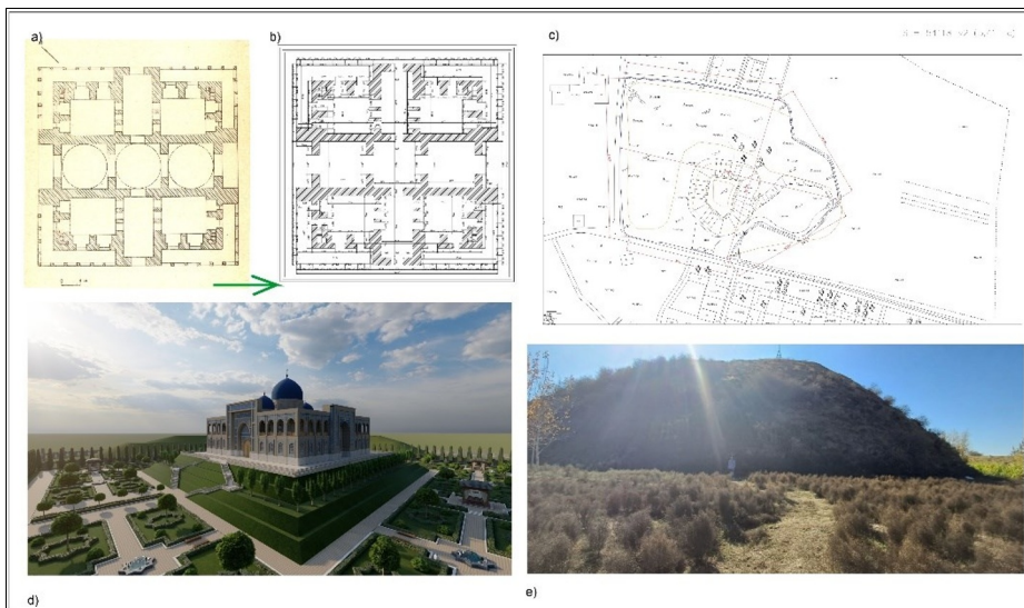
Fig. 3. Author's project proposal for the architectural revival of the Amir Temur's Garden Bagi Buldi. a) Reconstruction drawing by archaeologist U. Alimov; b) 1st floor plan; c) Executive tacheometric and topographic survey of Bagi Buldi; d) 3D perspective view of the Bagi Buldi garden and its palace; e) A platform on the top of which trenches from the foundations of the former Bagi Buldi palace were found.