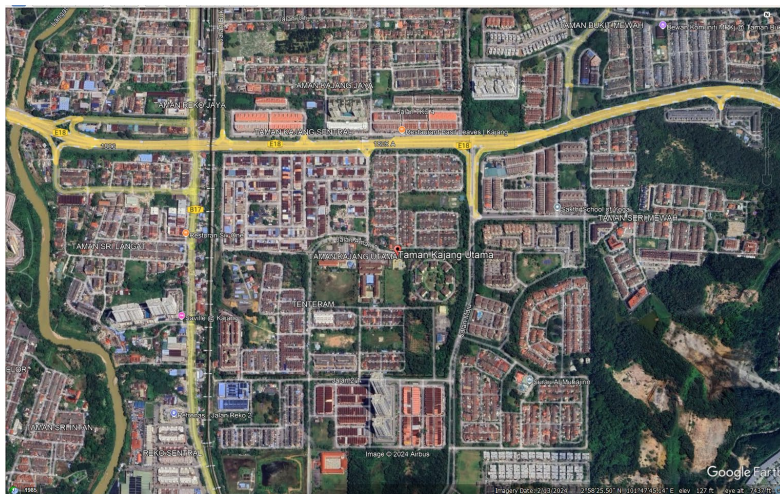
Fig. 2. Map of Kajang Utama Hilly.