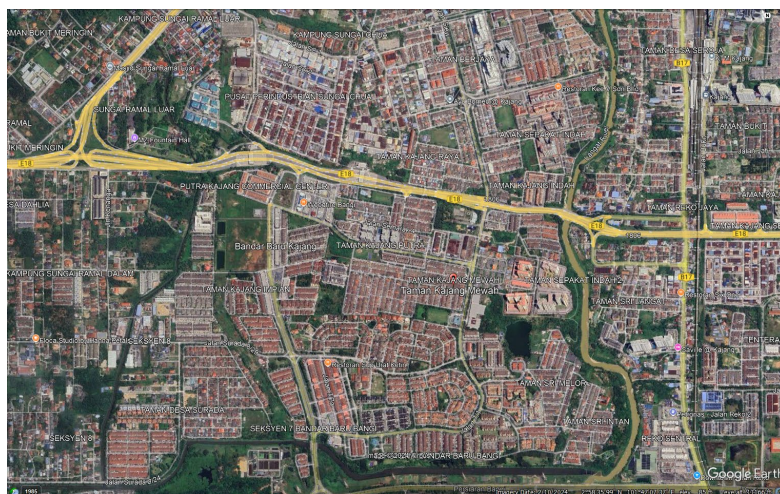
Fig. 3. Map of Kajang Mewah Hilly.

Analysis of the study was made using SPSS (Statistical Package for the Social Science) version 25.0. There were two types of analysis in this study including descriptive analysis and Principal Component Analysis (PCA). Descriptive analysis was carried out to determine the descriptive data of demography profiling of the respondents in both Kajang Mewah Hilly and Kajang Utama Hilly. Next is the Principal Component Analysis (PCA). After the data collection process, the data collected had to go through the process of standardisation and normalisation.