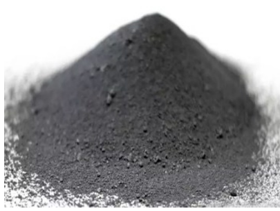
Fig. 1 Silica Fume