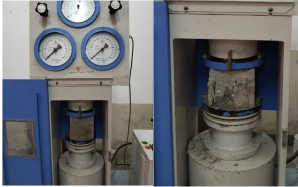
Fig. 6. Testing of cubes under Compressive loading