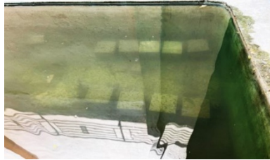
Fig. 4 Curing of cube specimens

Casted cube specimens were placed in the curing tank as displayed in Fig. 4, after removal from the moulds, the curing process is vital as results in a hydration process and harden the concrete.