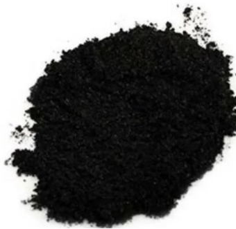
Fig. 2 Graphene oxide

Graphene oxide (GO) is a powder composed of carbon atoms arranged in a hexagonal lattice structure, with a purity value of more than 98% carbon in Fig.2. GO is the most difficult material, having a higher Young's modulus of 1TPa and exhibiting great tensile strength, accessibility, and heat conductivity, as well. Enhanced dispersion results in a homogeneous concrete mix and the material's water-retention capability reduces the permeability and improves resistance towards segregation in a reduced risk of shrinkage cracking.