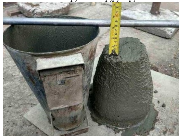
Fig. 5 Slump cone test

The workability is verified using the slump test. 0.38 w/c had been employed at first for testing purposes and to determine the dosage capacity of Super plasticizer. To achieve the necessary concrete grade, a w/c of 0.35 was chosen, and the slump was examined. The resulting result is displayed in Figure 6. This testing is conducted considering the matrix's void-filling property is crucial for achieving the necessary strength. The maintained weight-to-cash ratio of 0.35 was used for choosing the aggregate ratio.