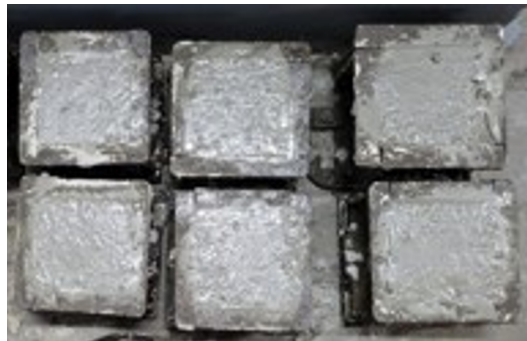
Fig. 3 Casting of Cubes with GO

The materials were added uniformly, and then water and chemical admixture was added, the action of mixing was done before the concrete was set, and the mixed concrete was transferred in the moulds of sizes 150mm as depicted in Fig. 3, and placed at room temperature for 24 hours.