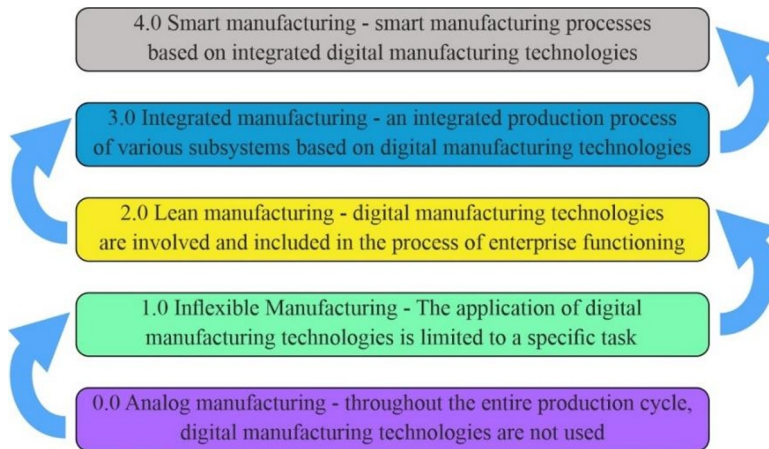
Fig. 1. Strategies for the technological development of production in the conditions of the 4th industrial revolution.

The greatest effect of digital transformation is achieved in the functional area of sales logistics. The functional area of procurement logistics is less susceptible to an increase in efficiency with the use of digitalization tools. However, the logistics system of a petrochemical enterprise is important to consider in conjunction with production cycles. In this article we propose to rely on the classification of the digital maturity of a production system (Fig. 1).